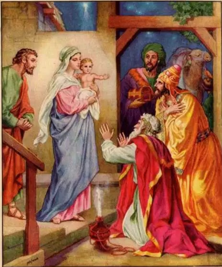
THE VISIT OF THE WISE-MEN

May the splendor of your majesty, O Lord, we pray, shed its light upon our hearts, that we may pass through the shadows of this world and reach the brightness of our eternal home. Through our Lord Jesus Christ, your Son, who lives and reigns with you in the unity of the Holy Spirit, one God, for ever and ever